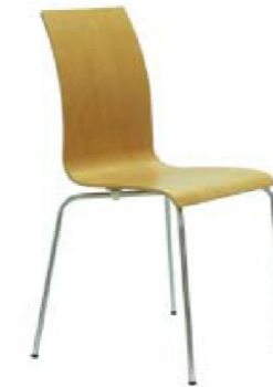
木纹椅 x 3 nos Graininess Chair (l) 395 x (w)410 x (h)850