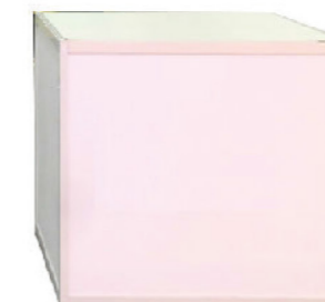
锁柜 x 1 no Lockable Cupboard (l) 1000 x (w)500 x (h)1000