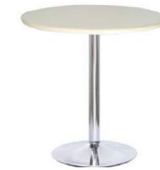
圆台 x 1 no Round Table (d) 700 x (h)750