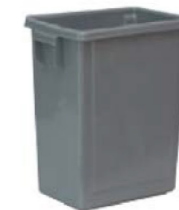
垃圾桶 x 1 no Wastepaper Basket (l) 300 x (w)220 x (h)300