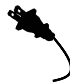
Easy to Integrate