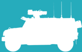
Safety & Defence