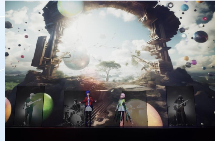
360-degree free viewpoint music live “αU (alpha-U) live”

The live venue changes in real-time to environments such as forests, oceans, or cities based on the input from the audience. This reduces production time for creators and allows audiences to enjoy customized experiences.