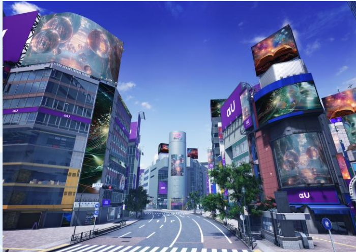
WEB Metaverse “Shibuya”

With cloud rendering, it becomes possible to display a realistic 3D Shibuya, which normally requires a long loading time, in just a few seconds from a web browser, allowing users to freely walk around with avatars.