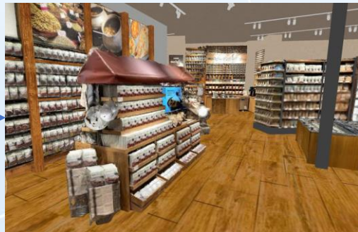
Digital twin of the store