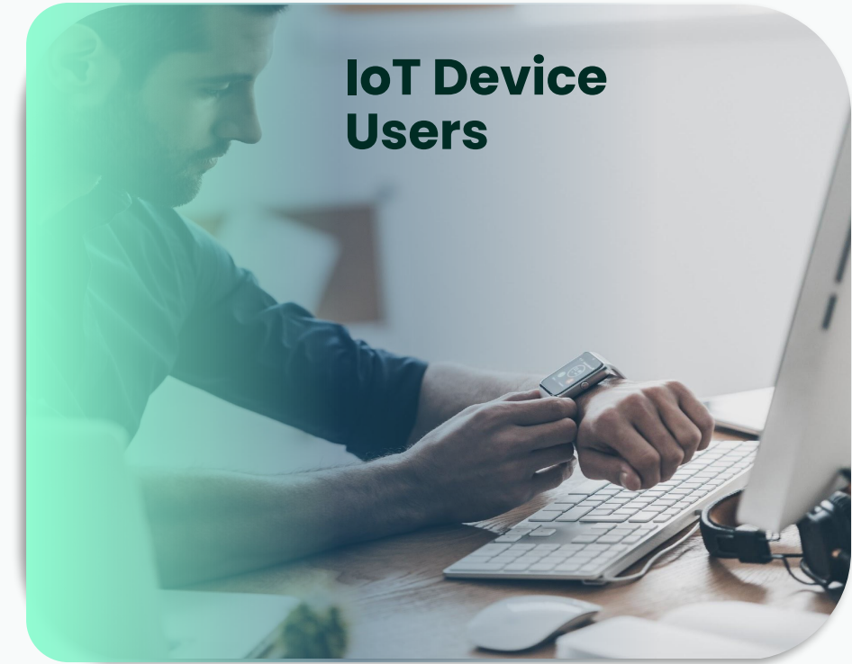
IoT Device Users