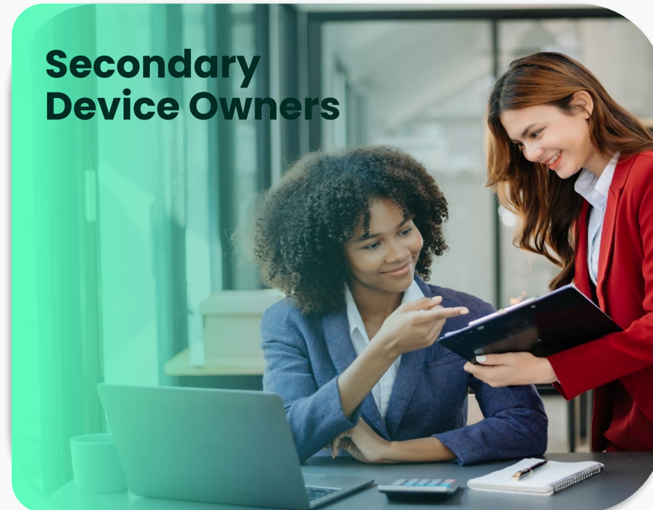
Secondary Device Owners