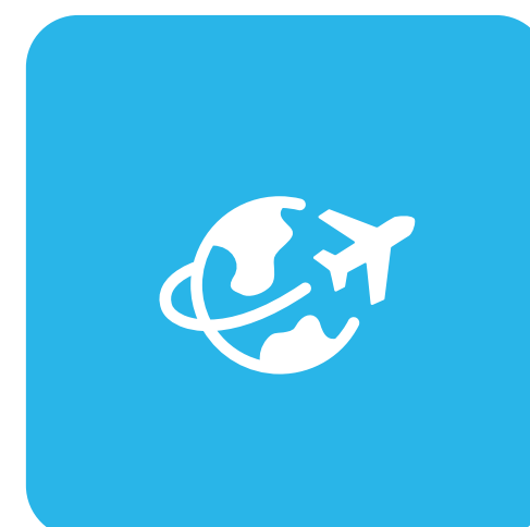
Travel and Hospitality