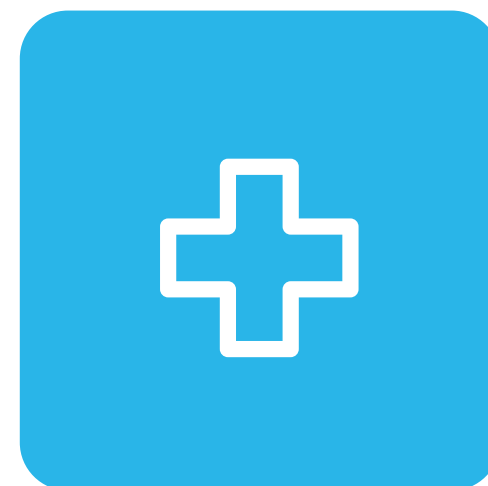
Healthcare and Life Sciences